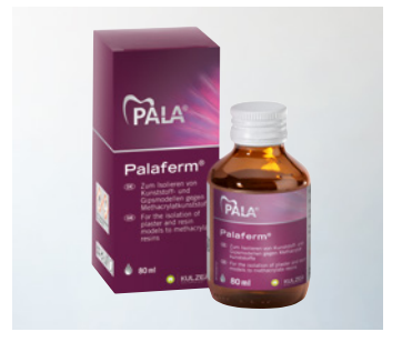
For precise insulation of 3D printed and plaster models from methacrylate acrylics.