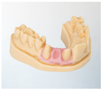
dima Print Gingiva Mask for flexible gingiva masks.