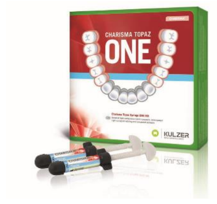
Charisma Topaz ONE KIT

Charisma Topaz ONE Shade for basic restorations, e. g. in the posterior region. All known Charisma Topaz shades for more complex and aesthetically challenging cases, e.g. in the anterior region.