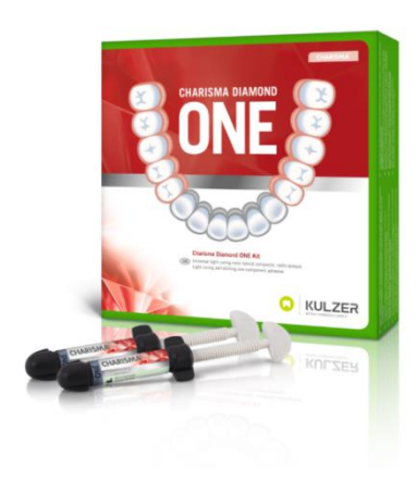
Charisma Diamond ONE KIT

Charisma Diamond ONE Shade for basic restorations, e. g. in the posterior region. All known Charisma Diamond shades for more complex and aesthetically challenging cases, e.g. in the anterior region.