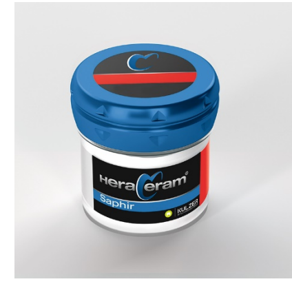
Fig. 1: HeraCeram® Saphir - the new metal ceramic line