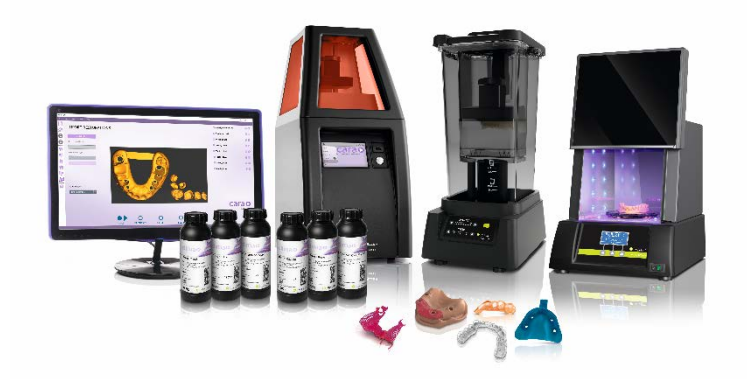
Fig. 3: cara Print System – Making the entire 3D-printing process quick, precise and economical.