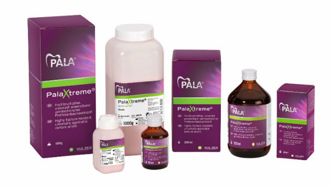
Fig. 5: PalaXtreme® - the strong high-impact denture acrylic