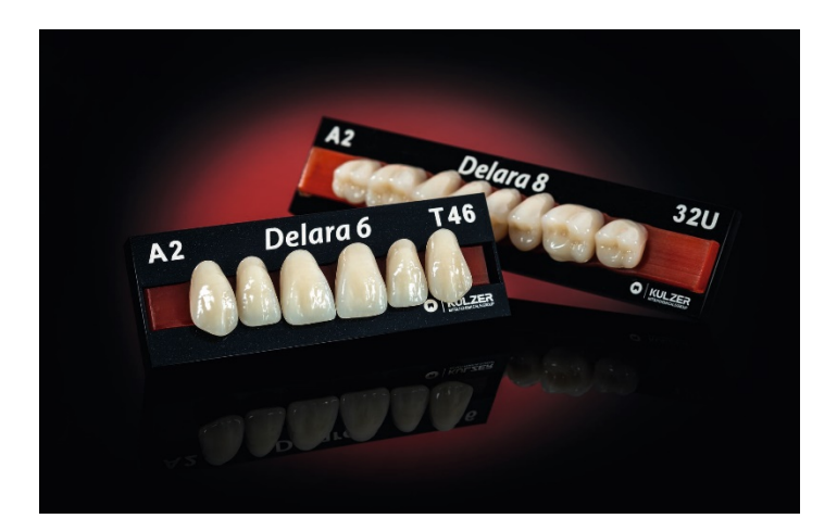
Fig. 4: Delara® - the new tooth line from Kulzer

Fig. 3: cara Print System – Making the entire 3D-printing process quick, precise and economical.