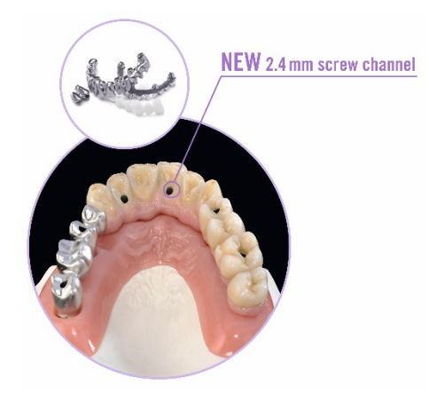
Fig. 6: cara I-Bridge<sup>®</sup> X – the original now with 2,4 mm screw channel and up to 30^{\circ} angulation.