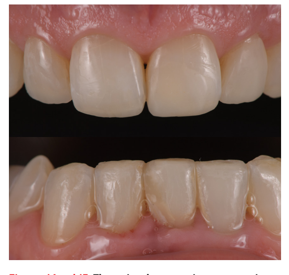
Figures 14 and 15: The patient knew any improvement in soft tissue health was her responsibility, following which definitive lower anterior bonding would be completed

The plan also included transitional bonding to the mesial aspects of LR2 and LL1 to close the resultant diastema. Further soft tissue assessment and transitional bonding reduction would need to be carried out as the anterior teeth were retracted. This would be followed by a course of teeth whitening and concluded with upper anterior form corrections with definitive composite