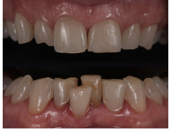
Figures 1 and 2: The patient was unhappy with the appearance of the lower anterior teeth and concerned that the upper teeth appeared dark and uneven

It was confirmed that the patient was happy to attend appointments with a dental hygienist every three months and regular visits during the treatment programme. The patient was also consulted about minimally invasive techniques and whether she would accept a slightly compromised result with visually discreet procedures. It was explained that the final stage of treatment could not be completed until the gum tissues were at optimal health.