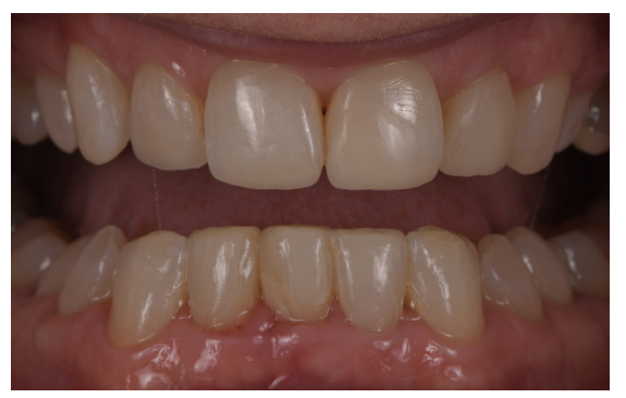
Figure 12: A lasting lustre and homogenous surface were created with the upper definitive bonding; lower transitional bonding was also applied