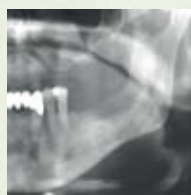
Fig. 2 Extensive bone regeneration of the cyst cavity is visible in the 3-month postoperative radiological check.